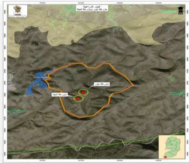
Map ():"Mor" and "Shabtai" pastoral/agricultural colonial agricultural outposts

The colonial outposts "Mor" and "Shabtai" were established in the south of Hebron by the colonizers in order to displace the Palestinian citizens and prevent farmers from reaching their lands. "Mor" farm was established in 1999, while "Shabtai" was established in 2017, as both colonial outposts control more than 3,180 dunums of land.