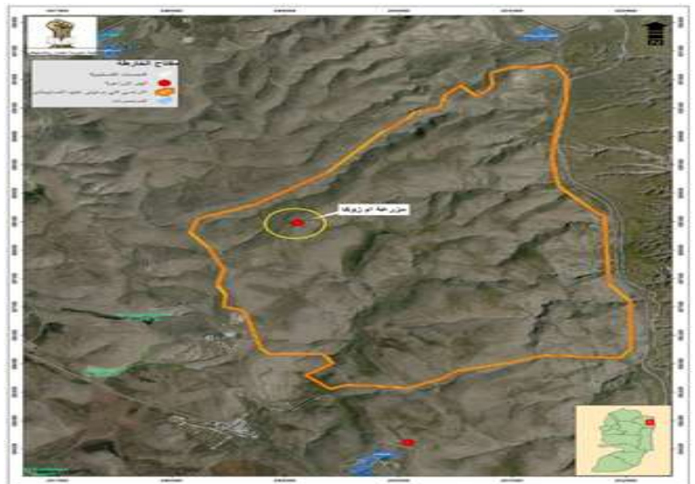
Map (): Um Zuka pastoral/agricultural colonial agricultural outpost

The "Um Zuka" pastoral/agricultural colonial outpost is one amongst other 6 pastoral/agricultural colonial outposts established by colonizers in the Upper Jordan Valley in the past five years. This "natural reserve" was established in 2016 in place of Khirbet Al-Muzoqah, a Palestinian village destroyed by Israel Army after the occupation of West Bank in 1967. The pastoral/agricultural colonial outpost controls over 14,000 dunums of land, and prohibits Palestinians from entering or grazing their herds in the area.