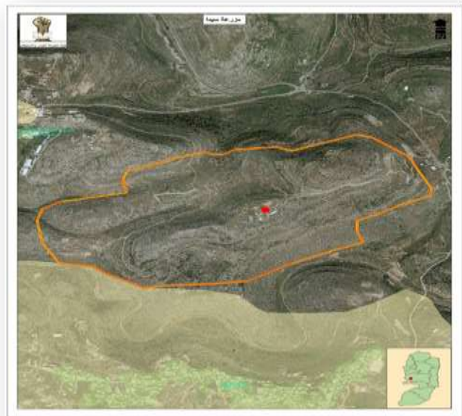
Map ():"Sde Bar" pastoral/agricultural colonial outpost

The "Sde Bar" colonial outpost is established by the Israeli colonizers in Al-Risan area, west of Ramallah. This "farm" was established in 2017 on citizens' lands in Villages of Kifr Ne'meh and Deir Ibzai'. This colonial outpost controls an area of 750 dunums already declared as "state land". The Palestinian citizens are prohibited from access to these lands, including land reclamation or cultivation.